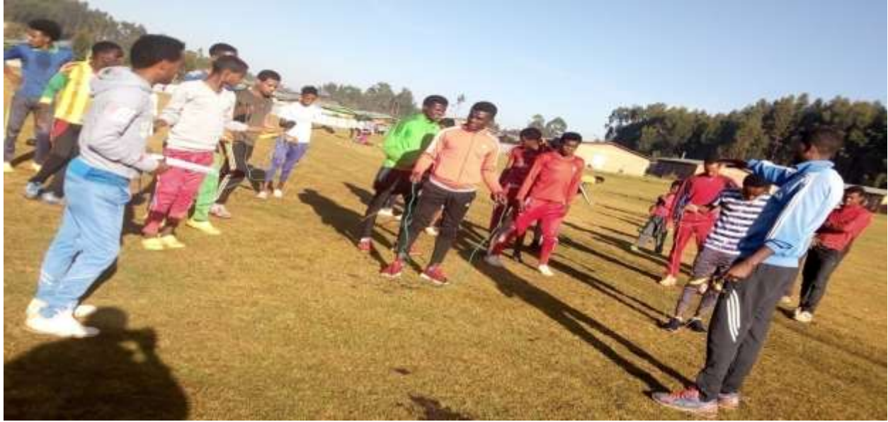
Figure 4 rope skipping