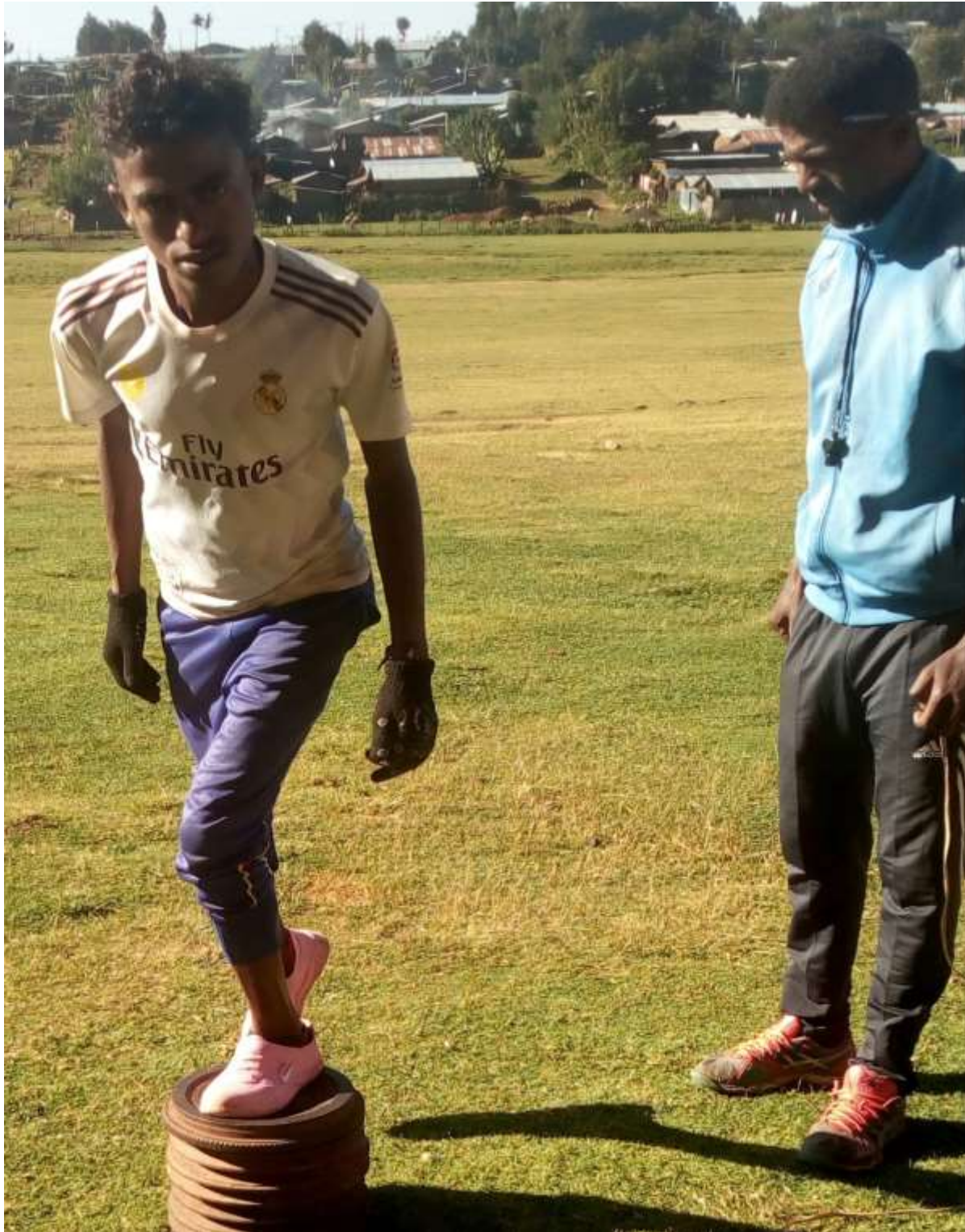
Figure 2 step up test