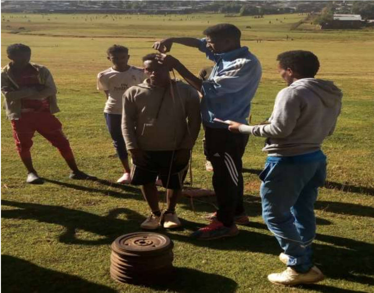
Figure 3 height measurement to calculate BMI